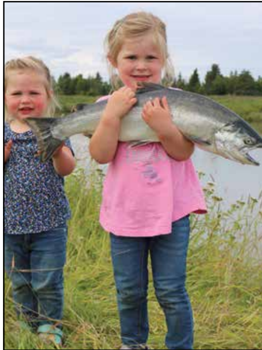
Take a kid fishing!

SS = Silver (coho) Salmon RT = Rainbow Trout KS = King Salmon