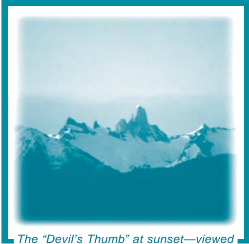
The “Devil’s Thumb” at sunset—viewed from Mitkof Island, Southeast Alaska.

Most of the area lies within the Tongass National Forest boundary and is managed by the U.S. Forest Service. Remaining land is owned by state and local governments and the private sector. Kake Tribal Corporation owns the largest blocks of private land in the area.