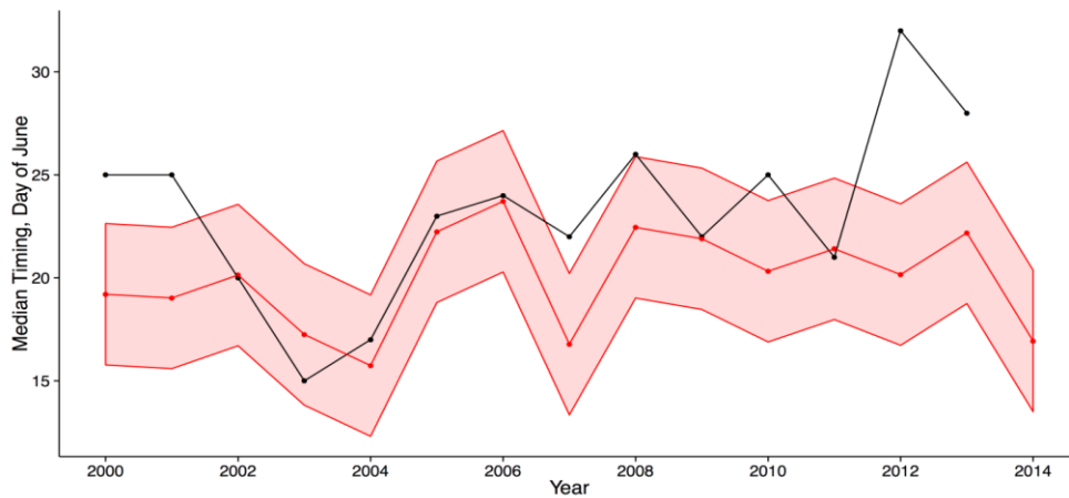
Figure above. Historical observations of median run timing (black) and predicted run timing (red). The ribbon corresponds to the prediction interval generated using MAPE. Note that 2012 was the coldest Spring ever observed and 2013 was only slightly warmer.

order to calculate MAPE. MAPE for this approach is 3.2 (15%), 3.3 (25%), and 3.4 (50%) days. The figure following shows model performance from 2000 onward for predicting the 50% point of run timing.