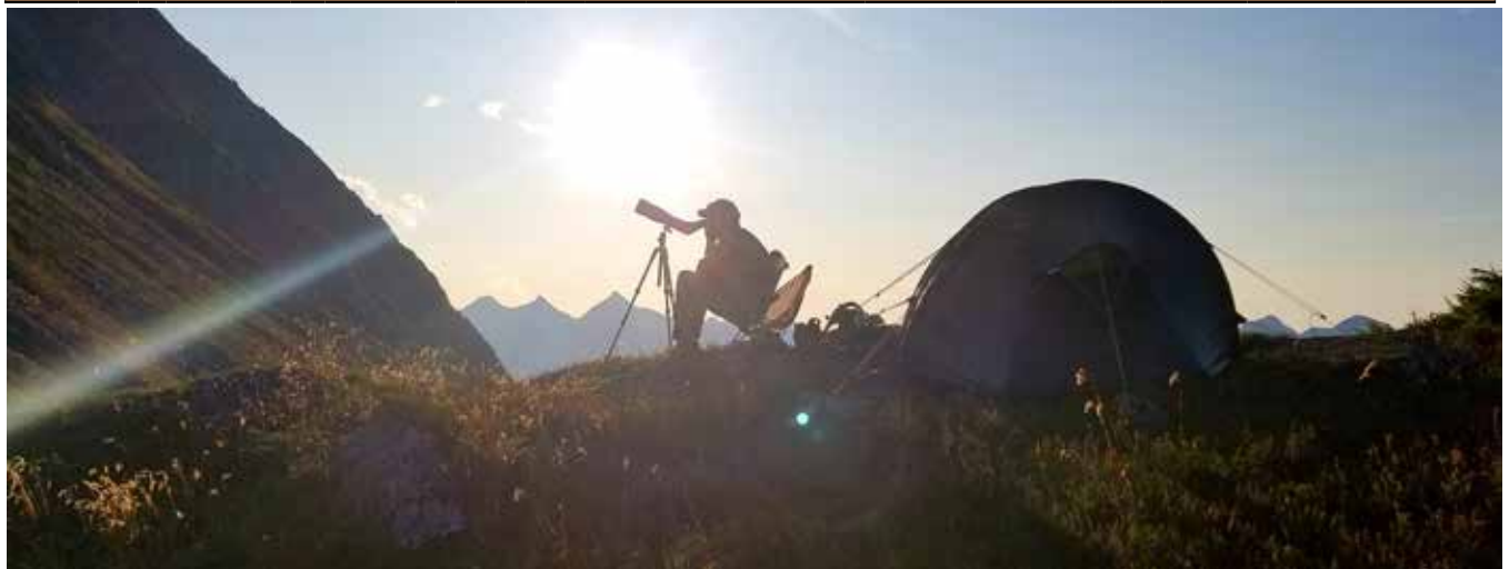
Jon Pearce glasses for mountain goats, Baranof Island.

In Unit 23, snowmachines may be used to position caribou, wolf, and wolverine for harvest and they may be shot from a stationary snowmachine .